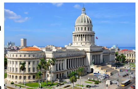
Capitol Building, Havana