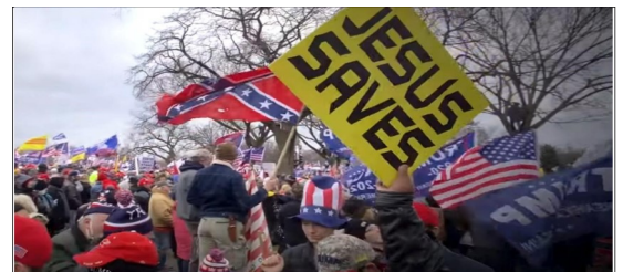
God & Country , documentary film